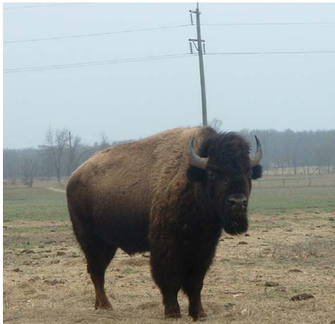
Modoc Tribe, February 2007