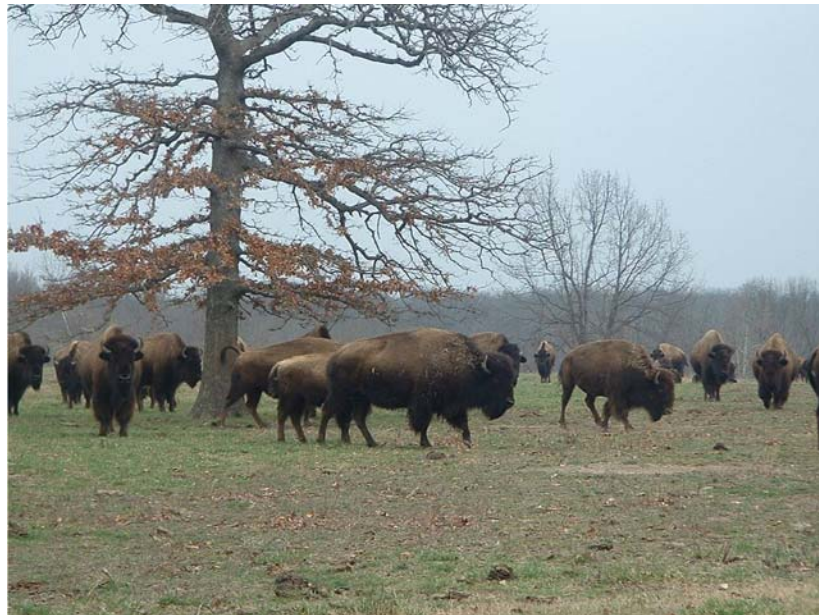
Modoc Tribe, February 2007