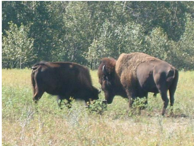
Turtle Mountain Tribe, August 2007